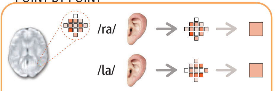
A new analysis. Pattern classifiers can detect differences in the neural activity elicited by different stimuli such as speech sounds (middle: small colored dots represent the fMRI signal of individual voxels) that would be averaged out in the conventional fMRI analysis (far right).

between experimental conditions—viewing photos of faces versus places, for example but it assumes that neurons from different voxels in the region of interest all behave the same way. That's almost certainly not the case, says Nikolaus Kriegeskorte, a neuroscientist at the National Institute of Mental Health in Bethesda, Maryland.